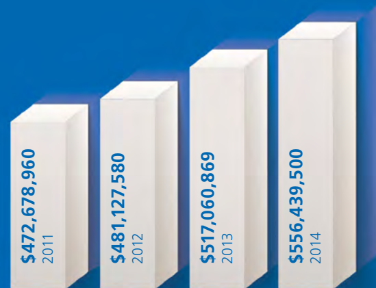
Total Net Loans